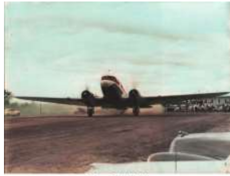
East West Aircraft

-Sea Plane VH - BKQ Trans Oceanic Airways at Port Macquarie - a Sunderland MkIII