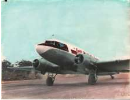
East West Aircraft

-East West aircraft on runway with airport people and cars in background. Bonnet of car in foreground