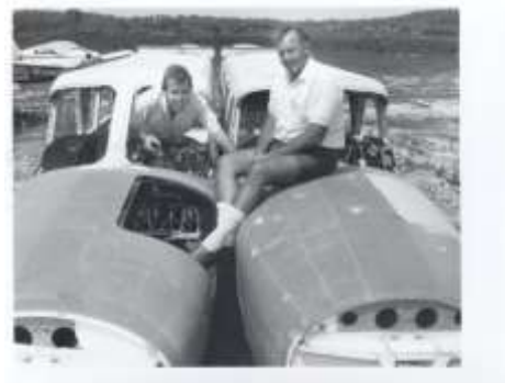
Old Aircraft Relics