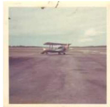
Plane at Settlement Point

- First Plane to arrive in Port Macquarie