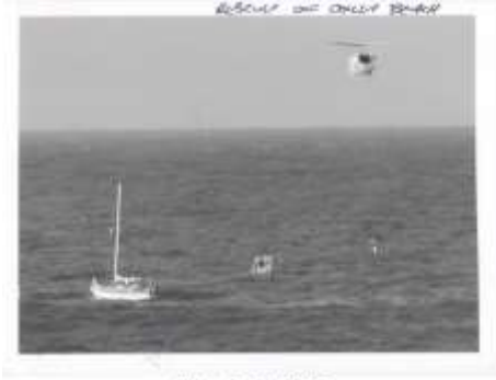
Rescue off Oxley Beach