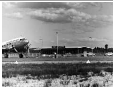
Port Macquarie Airport

-East-West Airlines plane on tarmac showing men boarding and luggage being loaded