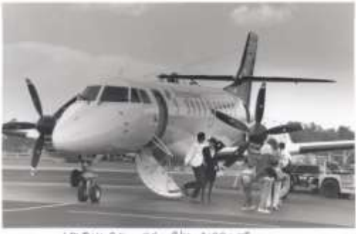
IMPULSE AT P/M AIRPORT Picture Port No 15038