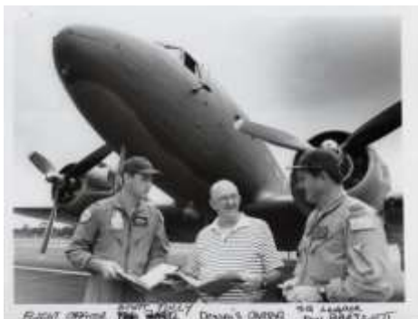
Air Crew with Air Force personnel

-Helicopter possibly could be for joy rides