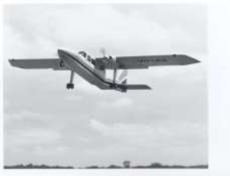
Aircraft over Port Macquarie

- Oxley Airlines Port Macquarie Air Service which folded in December 1992. Ran for 18yrs under Brian Peel. Piper Navajo Aircraft one of fleet of 5