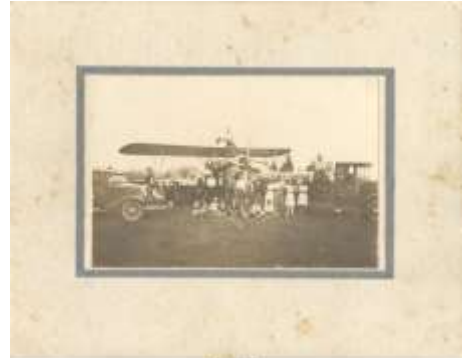
Aircraft at McInerney Park