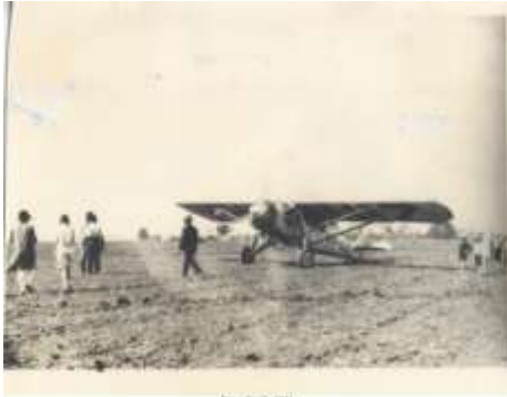
Early Aircraft to Port Macquarie