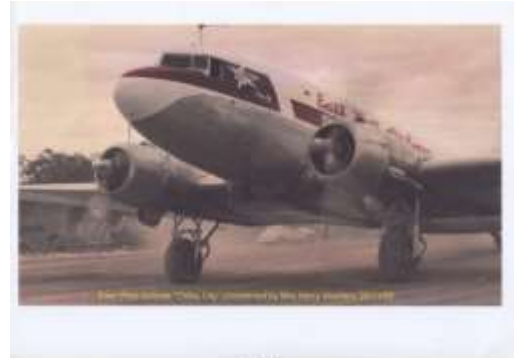
Opening of Port Macquarie Airport

-The "Oxley City", aircraft of East West Airlines on runway