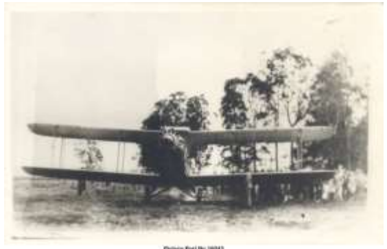
Plane at Settlement Point