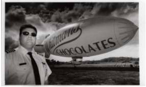
Air Ship advertising Whitmans