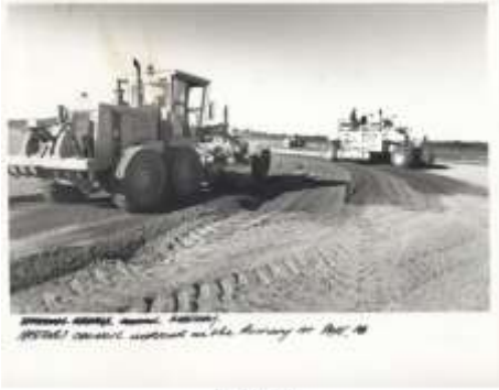
Port Macquarie Airport