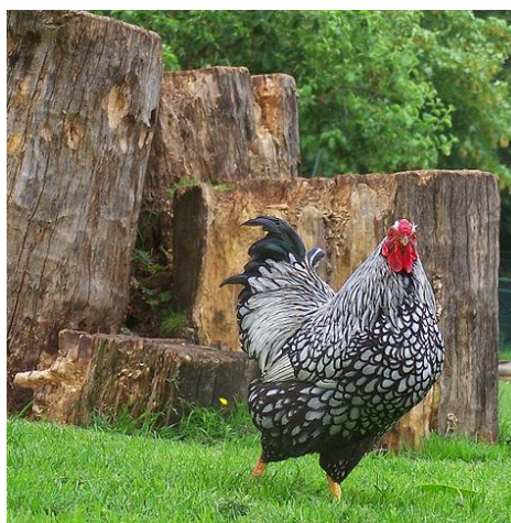
Image: Silver Lacing Wyandotte Rooster 1 .