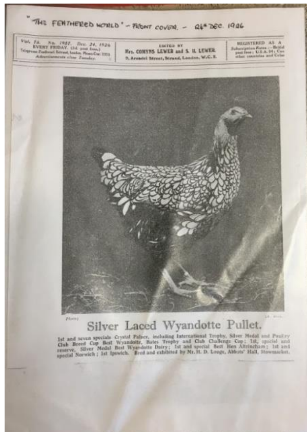
Image: Extract reporting the win in the Feathered World 24 th December 1926. 2