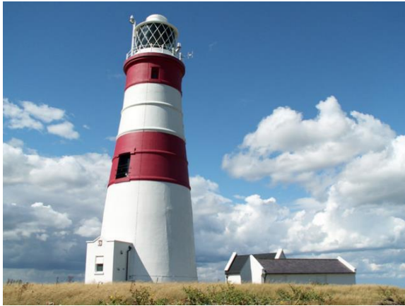
Image: Orford Ness Lighthouse 5