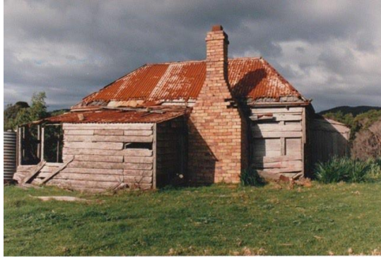
The Hermitage in 1988