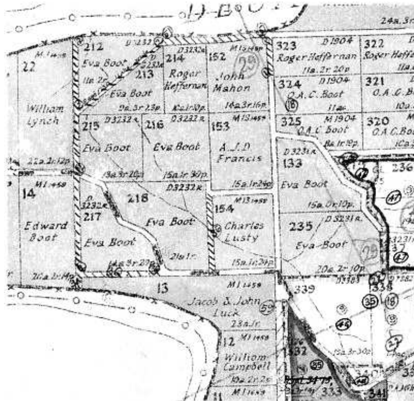
Parish map showing Boot family holdings at Yarragee

Also in the Museum can be found some of the reference books used by Dr Boot.